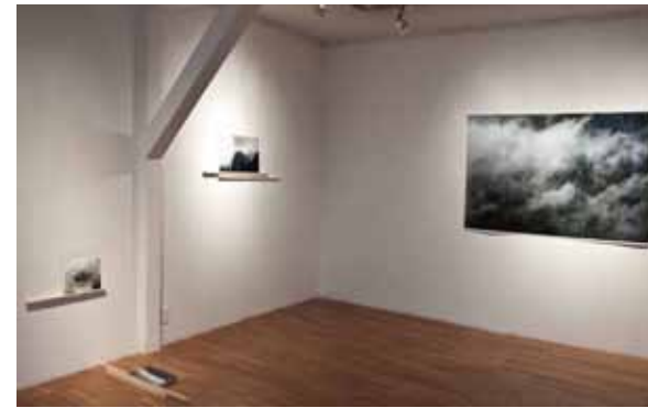
time and moment (2012) / Gallery Kobo Chika, Tokyo

What does this cut out imply for you? Does the geometrical ornament have any connection to the "crystal"? GD: It is the inner and outer eyed, being in front of and also behind someone's seeing. Concerning those two separations I observed the possibility of balancing. Photographs, usual a two-dimensional item, becomes a kind of qualified and conditional transparency. Beyond