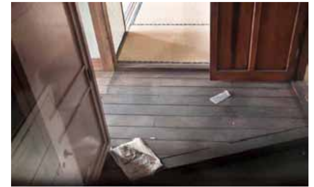
fading memories – old story (2012) / Tokyo Wonder Site Aoyama, Tokyo

Or with time and moment , the audience would have felt that s/he was installed in the natural space that was reconstructed by the artist's grand hand. A sense of awe inspiring for the artistic intuition, or the god hand, haunts to the experience of the gallery space itself. The sublimity is there. Given by nature, the crystallization of the geometry is