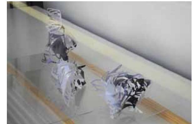
time and moment (2015) / Christophe Guye Galerie, Zurich

You as an editor, an art critic, what is your personal view upon the distinctive influence Japanese culture has in art? Do you have an explanation why the European art market and the art scene has an increasingly and keen interest in Eastern art and culture over the last years? And how is it perceptible for you? Does it describe a new movement, another cosmos in European art?