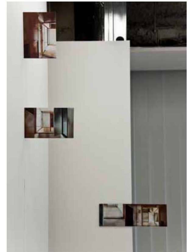
fading memories - old story (2012) / Tokyo Wonder Site Aoyama, Tokyo

—What is interesting for you about Japanese culture?