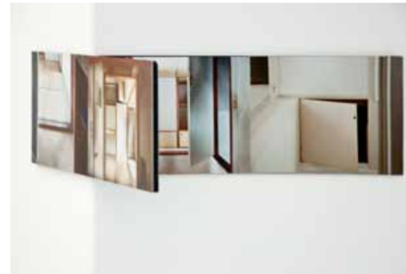
fading memories – old story (2012) / Tokyo Wonder Site Aoyama, Tokyo

By walking, passing, reflecting, searching, tuning, reading, dwelling, seeing, re-reading, re-acting, re-passing, my perception within the space all this has to be observed.