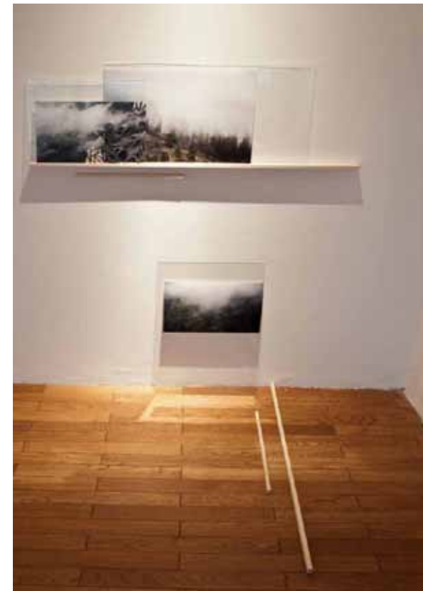
time and moment (2012) / Gallery Kobo Chika, Tokyo

On these moments, precisely in LICHT RAUM LICHT (Kunsthalle Wil, SG, 2013), I presented this three spaces with different qualities and ambiances. You ask about the specific effect of the monochrome. In accordance with the decent light situation, which changes randomly or smooths and these works emphase on the ephemerality on this given situation. A sensitive subtle change in the perception of the visitor an awareness that has been by the non-obviousness of the spectator.